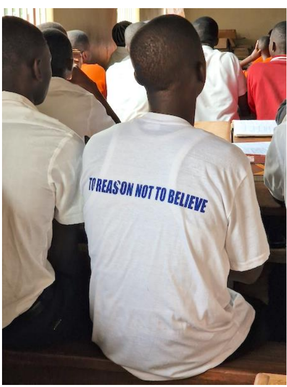
Isaac Newton School motto

the elderly and single mothers who have no immediate family to support them. Recently they have been putting signposts around the school with inspirational Humanist messages.