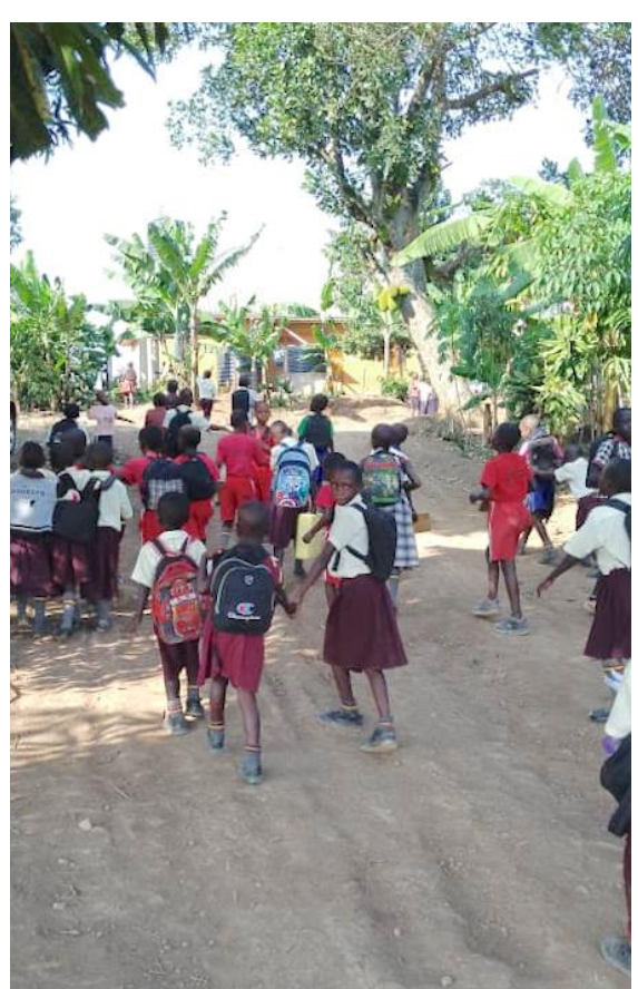
Happily walking to school

The most challenging time was during Covid-19. The lockdown left many schools here in a very desperate situation as many teachers left to seek alternative sources of income. After Covid-19 schools struggled to find teachers. We are grateful to UHST supporters for providing us with teachers' hardship payments during that time. This allowed us to retain most of our teachers. Because of the collapse of many schools, we have experienced an upsurge in applications to join our school and enrolment has risen to 785.