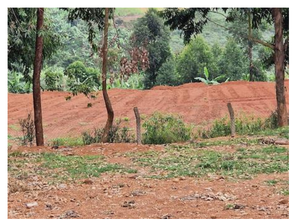
Levelling land for sports field

Level land next to the school to create a sports field, which will serve both the high school and the primary school.