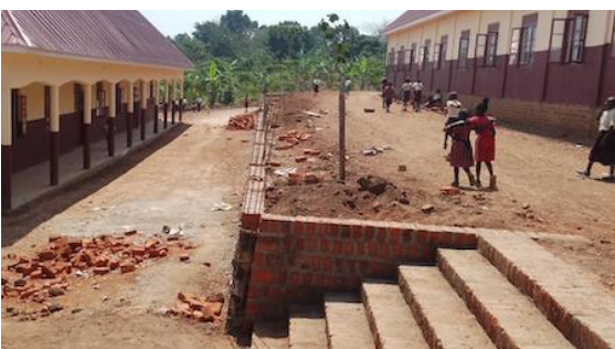
Soil stabilisation & drainage work between the new Junior and Infant Annexes