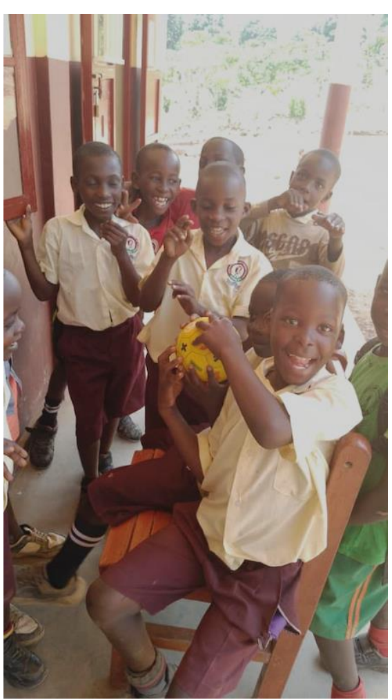
Infant children with new football