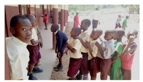
Children waiting to enter the Infant Annex

Since the school became inclusive and secular it has seen enrolment rise from 47 children in 2020 to 430 in 2024. Due to the support of UHST and its supporters we have transformed the old school by constructing: