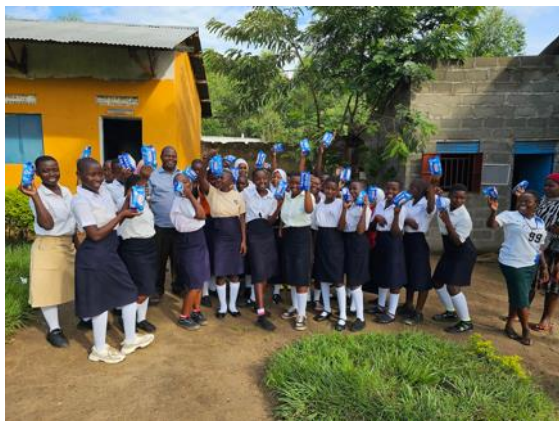
Kasese girls are happy to receive their Afripad packs from the Ethical Society of St Louis