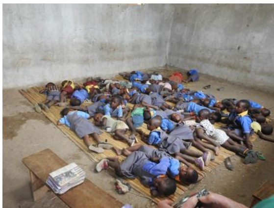
Kindergarten children take after lunch nap

The fact that this school borders Lake George means that there is lots of fishing activity and most of our parents earn a living from fishing and others are peasant farmers or running small businesses at the fish landing site.