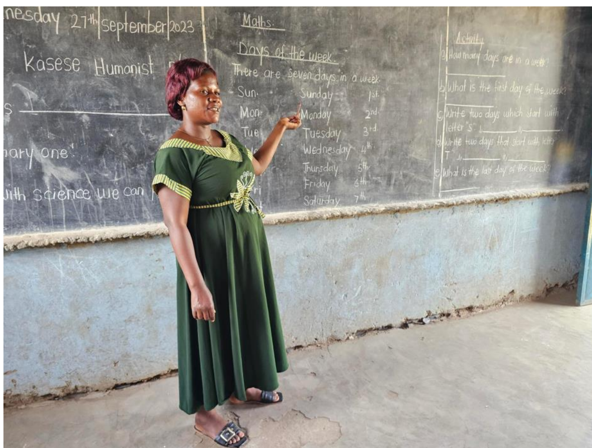
Our most important resource – our dedicated teachers

School Motto: With science, we can progress.