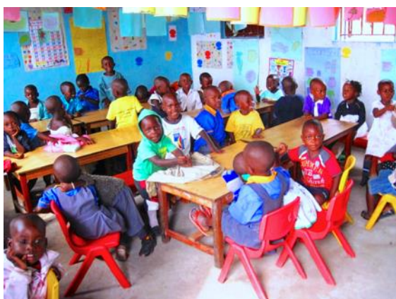
Kindergarten children at Bizoha

We have a team of 11 teachers and 2 non-teaching staff.