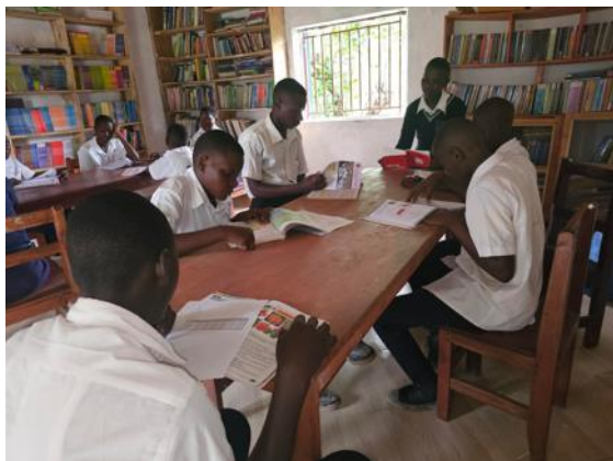
Children enjoy reading in our refurbished library