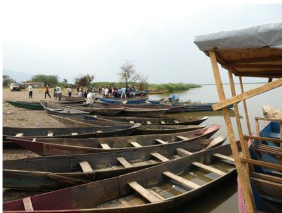
Families earn income from fishing

Our school continues to improve in the local exams, this school only has classes ending at Primary Six, and thereafter our pupils are transferred to the Bizoha campus for their P.7.