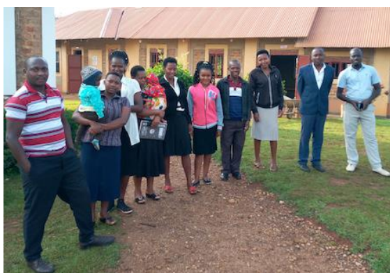
Teaching staff at Kanungu

Books & play materials School uniforms Humanist Ethos workshop for staff School/community opening event Supplementary funds for staff salaries, school food and firewood Bicycle Lightning protection for school buildings