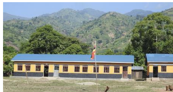
New classrooms at Katumba School