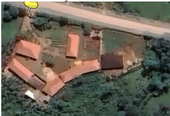
Kanungu Humanist Primary