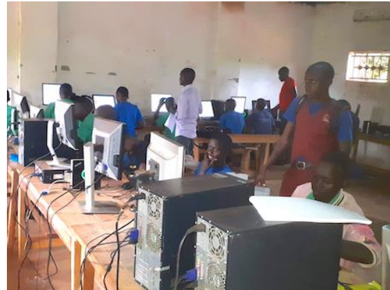
Refurbished computer room at Mustard Seed