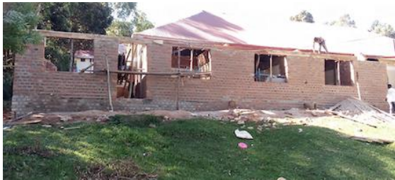
Post-earthquake repair of Isaac Newton girls' hostel